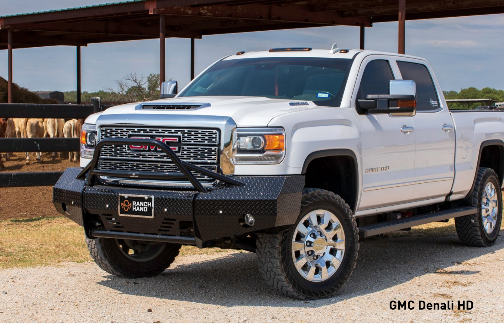
GMC Denali HD