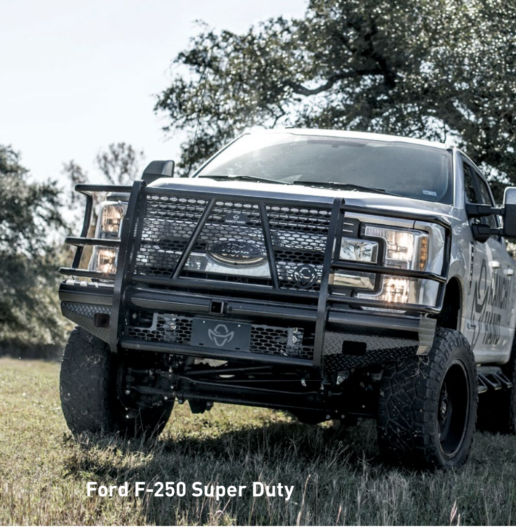
Ford F-250 Super Duty