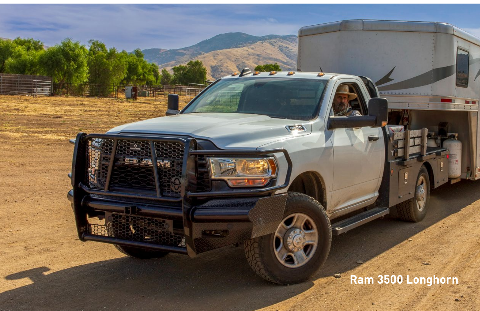
Ram 3500 Longhorn