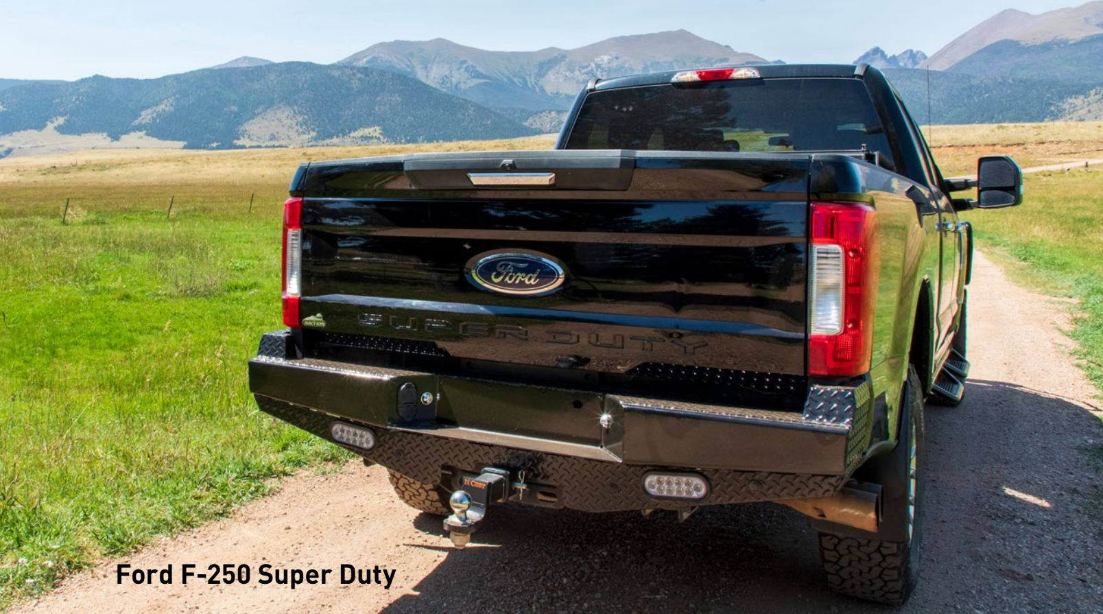
Ford F-250 Super Duty