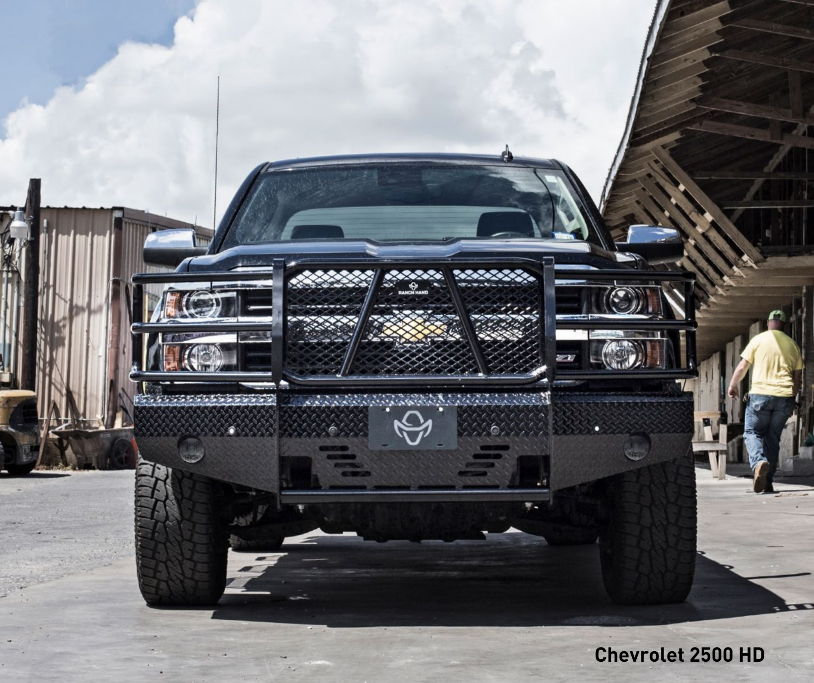
Chevrolet 2500 HD